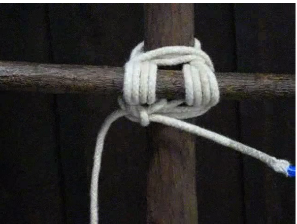
Frapping – this tightens the lashing. Wind the twine between the two sticks three times, pulling tightly as you go.